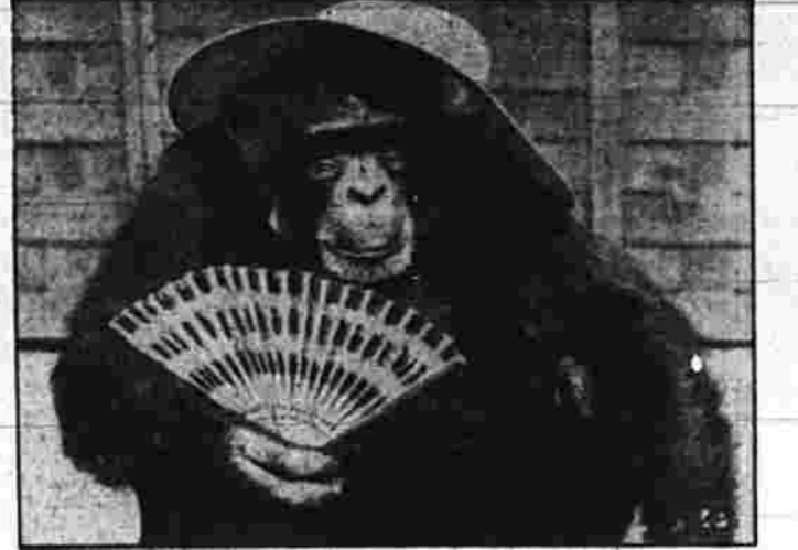
MONKEY WENCH fashions are now being shown at the London zoo. Hat brims in select animal circles will be broad and fans will complete the ensemble, according to the chimpanzee style dictator shown here with apparel borrowed from a visitor.