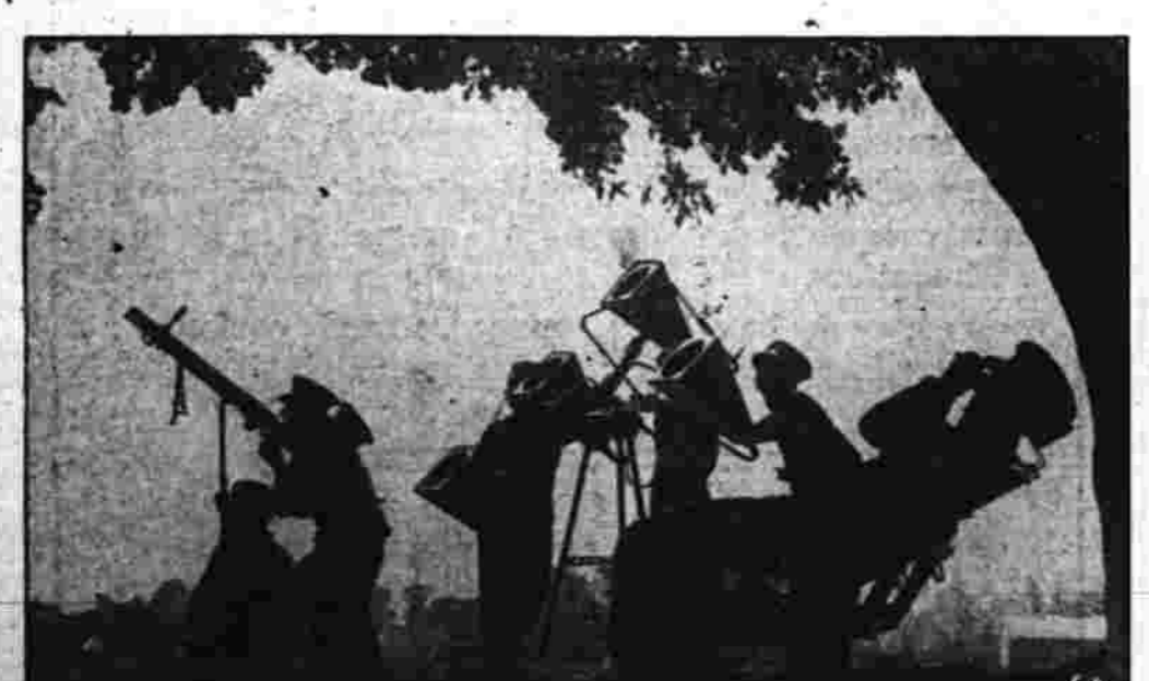
KEEPING AN EAR TO THE GROUND is essential in modern aerial defense. This is true of the ground forces, together with a Lewis gun, a machine gun, and a searchlight, as well as the anti-aircraft guns that are being used in London and southeastern England. Distant sounds of aircraft engines are magnified by the listeners and direction finders enable anti-aircraft guns to spot their prey.