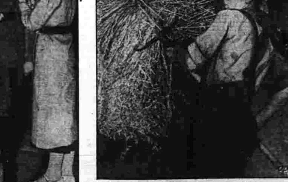
FEELING HIS OATS in a literal sense, this farmer near Crown Point, Indiana, is happy as he feeds a herd of prize cattle and looks forward to a prosperous harvest. Crop forecasts in August predicted an out crop for the nation far above that of last year, but slightly less than the average of crops during the period from 1913 to 1936. An unusually good harvest is expected this year by mid-western farmers due to the absence of drought, which, in 1934, and 1935, destroyed the crops and left them little or nothing.